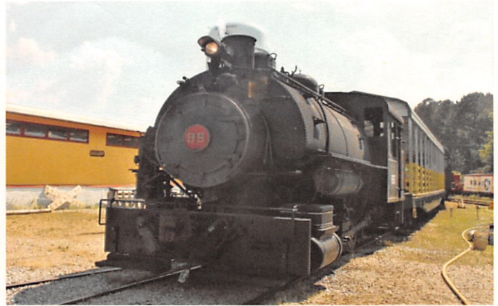
No. 85 waits for BBQ dinner train passengers at Rockton.

So far in 2018, proceeds from charter trips, Valentine Dinner Trains, BBQ dinner trains, Easter Bunny Eggspress trains, and other events has increased our revenue. The return of Steam Train excursions this spring added over 1,000 riders, including 120 extra fare BBQ dinner train passengers. We have over 8,100 "likes" on Facebook and have a strong base of followers that instantly get word of our events when they are posted on our Facebook Page. Our advertising on Facebook and in the SC Newspaper Network has increased our exposure and ridership and been very cost effective.