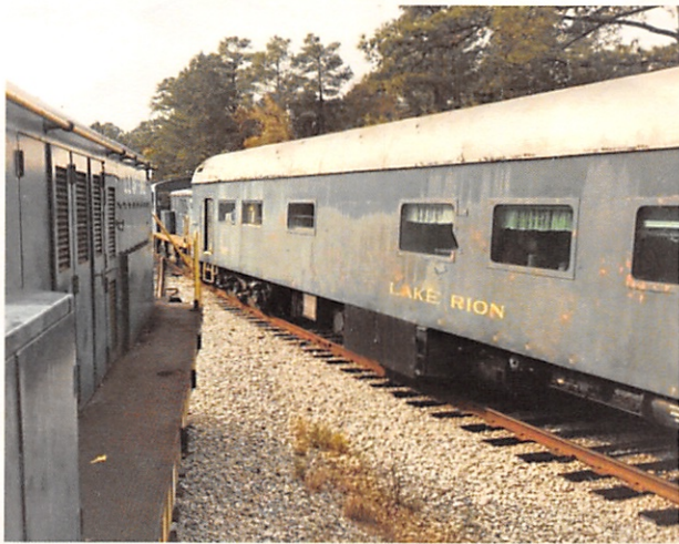
No. 1276 waits on the Guardian siding as No. 1249 passes.