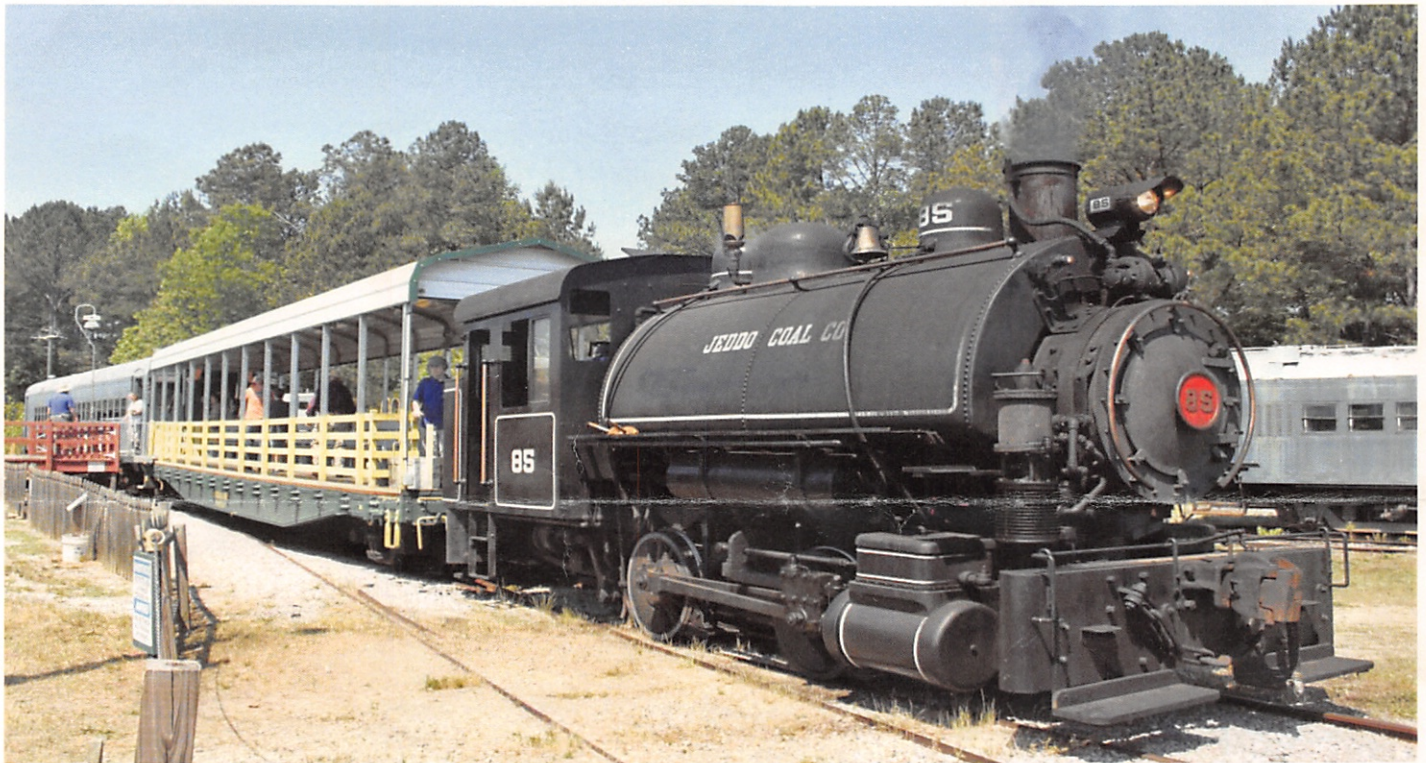
Recently restored Gramling Locomotive Works' Jeddo Coal Co. 0-4-0T No. 85 awaits passengers for the next excursion to Greenbrier at Rockton Station.