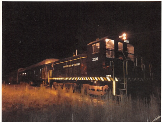
SW8 No. 2028 at Rion with the Valentine Dinner Train

After experimenting with the travel and wait times at both meeting locations, it was determined that Guardian would be a more optimal location for this operation. For the first time, locomotives Nos. 1276 and 1249 and their respective trains met and passed at the Guardian siding with their holiday consists. More passengers were carried, and surveys showed the passengers preferred not having to wait as long for the trains as in previous years when trips were run every two hours. A real Santa Express on the RR&W not only by name!