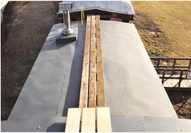
The Seaboard Air Line Caboose now has a sheet metal roof installed.